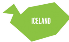
Figure 1 Consortium composition

The project is being conducted by a consortium of 18 partners from 7 European countries. (France, Spain, Portugal, Italy, Hungary, Belgium and Greece). This consortium involves a variety of both national/regional public institutions and private entities, including higher education institutes, research centres, industry clusters active in agriculture and 8 technological companies/SMEs that bring investment cases to be scaled up. The composition of the consortium is presented on Figure 1.